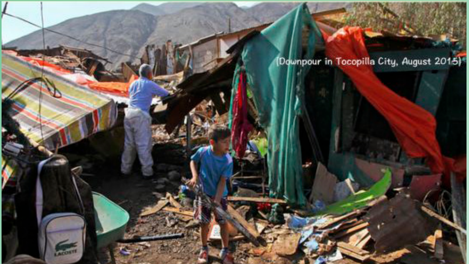
[Downpour in Tocopilla City, August 2015]